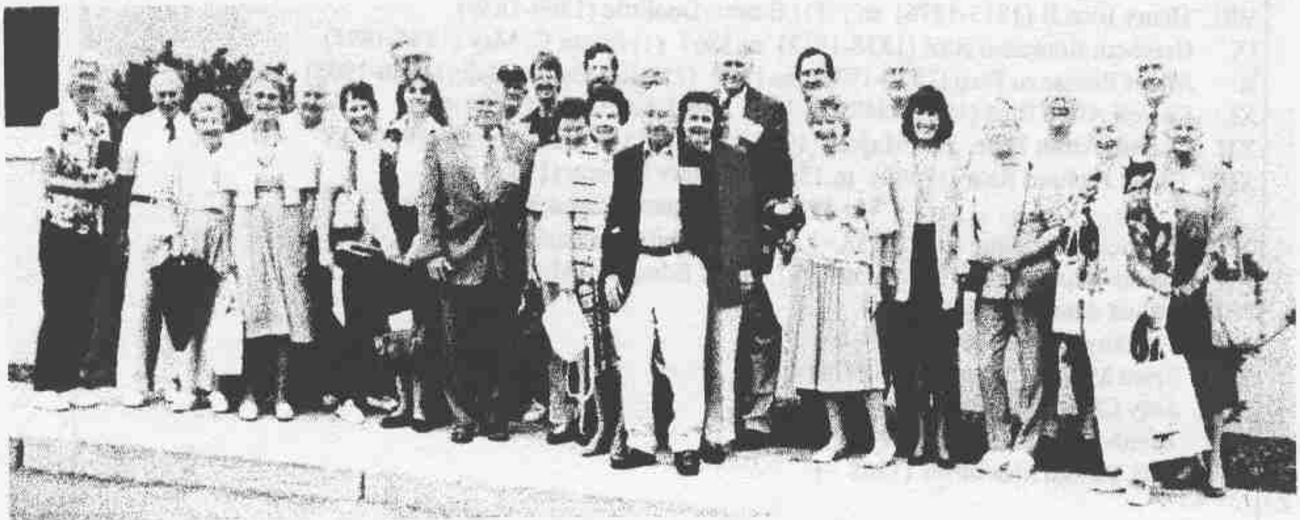
Dozens and dozens of cousins gather for the 1996 reunion