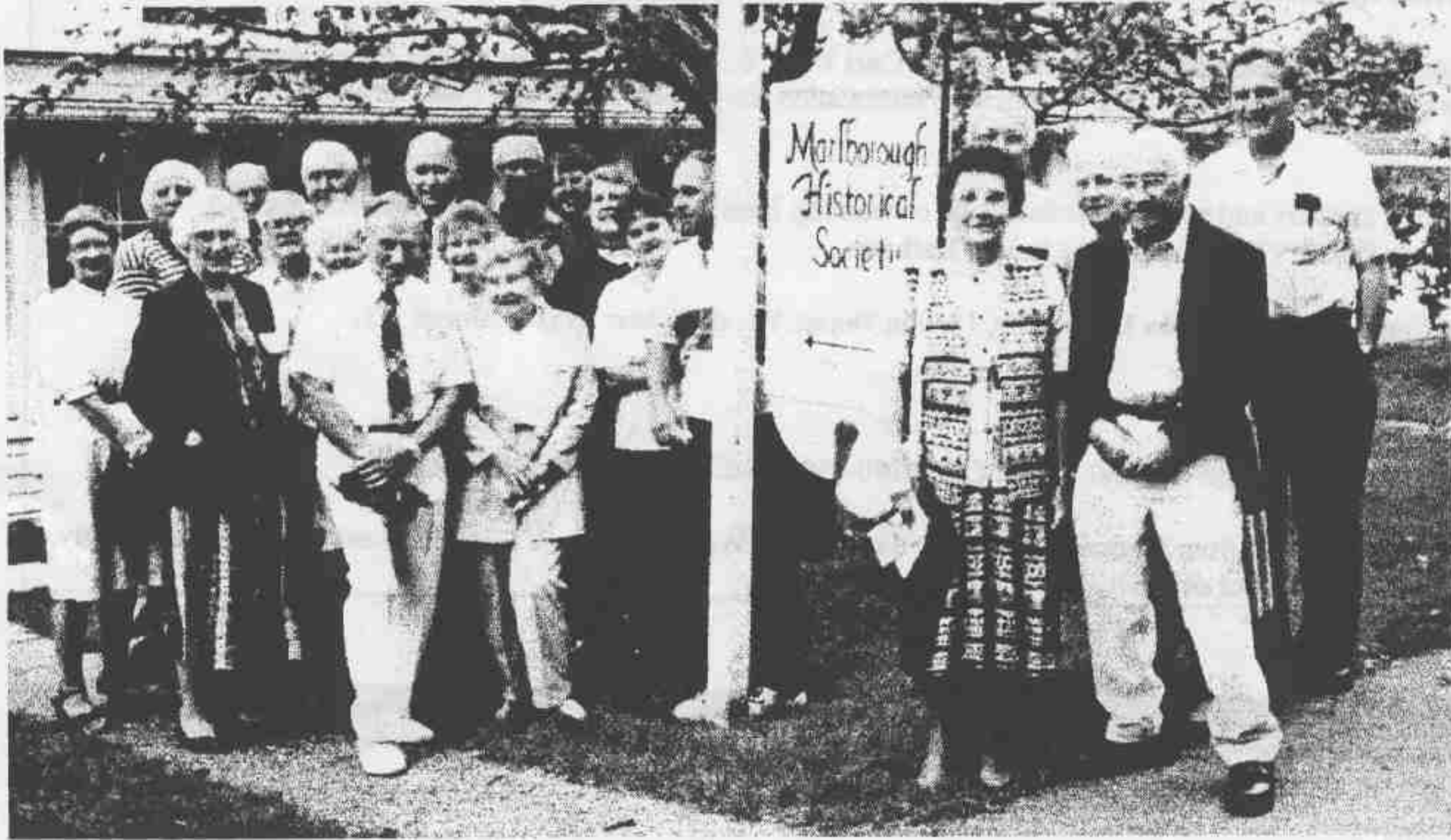
Cousins attending the reunion gathered for a tour outside the Peter Rice House, home of the Marlborough Historical Society.