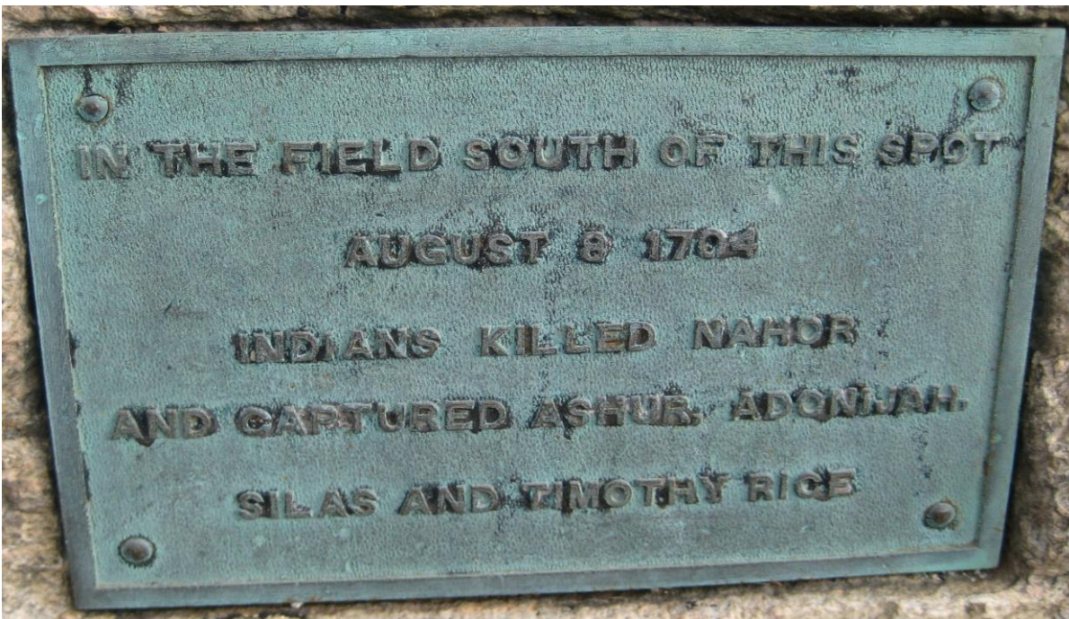
Marker at Rice Boys capture site in Marlborough, MA