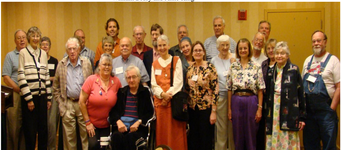
Attendees at 2010 reunion