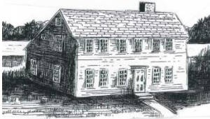
Deacon Edmund Rice Homestead Wayland, MA 1643 - 1912