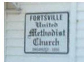
Fortsville United Methodist Church organized in 1850, photo from November 2016