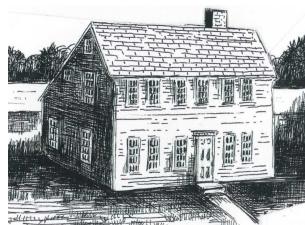
Deacon Edmund Rice Homestead Wayland, MA 1643 - 1912

The Edmund Rice Association publishes the newsletter four times a year: 1) Winter, 2) Spring, 3) Summer, and 4) Fall. The summer newsletter is devoted to the annual September Reunion and includes a description of the program and registration information. The other three newsletters include information of more general interest to our members. We invite all cousins to submit their genealogical information, newsletter corrections, items of interest, family articles and pictures, obituaries and queries. Send them to the newsletter editor: at editor@edmund-rice.org