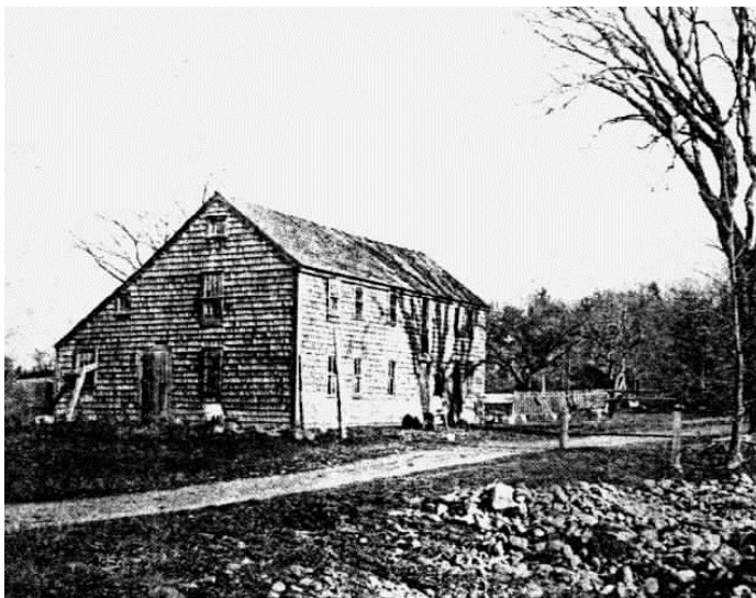
Figure 2. A late 19th Century photograph of the Edmund Rice Homestead near the spring. Built by Edmund in 1642 or 1643, the house remained within the Rice family until the early 20 th Century.

As early as 1640, Edmund was interested in acquiring lands on the outer reaches of Sudbury. On 3 April 1640, Edmund was granted by the Sudbury selectmen 20 acres of land adjacent to lands he had previously acquired near the Old Connecticut path, abutting land holdings of Puritan minister and Harvard College President, Henry Dunster. 3 On this so called upland land grant, Edmund would later build his 'house by the spring.' On 1 September 1642 Edmund sold his original four acre land parcel at the center of town to John Moore, the husband of his niece, and he then established residence out on his lands near the Connecticut Path. Edmund had a close relationship with his neighbor Henry Dunster, entering into a lease agreement with him on September 13, 1642 whereby he would lease some additional farmland from Dunster in return for Dunster receiving a share of the crops and proceeds. 4 It was about this time that Edmund built his saltbox-style 'house by the spring' (Figure 2).