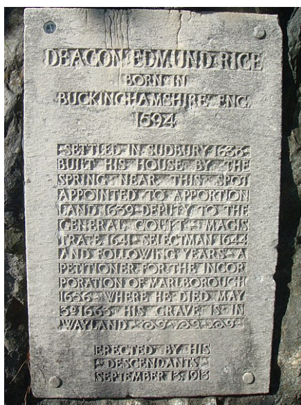
Figure 3. The Edmund Rice home site marker, erected by the ERA on 13 September 1913.